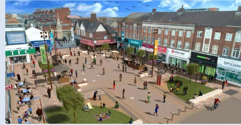
Topic launch- 7.10.24

Materials- Wheels and axels Children will learn about the key part of wheeled vehicle, to develop an understanding of how wheels, axles and axle holders work. Design and make a moving vehicle.